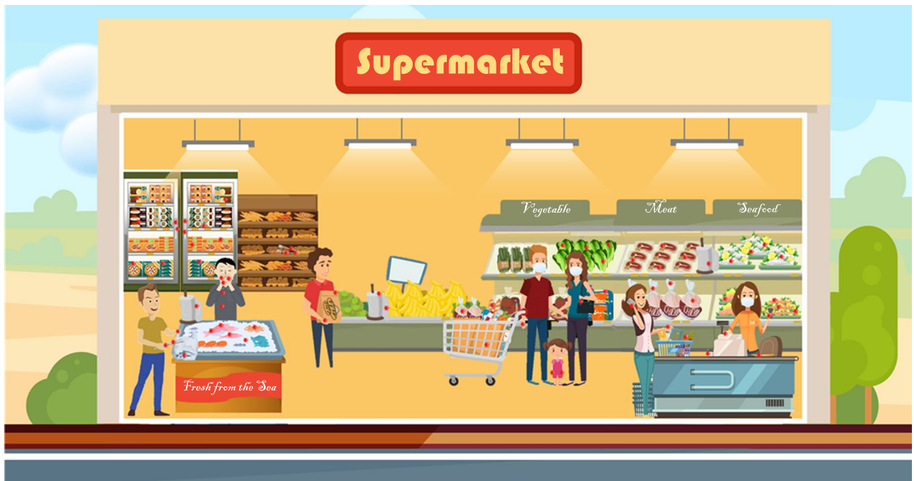
Fig. 1 Routes of virus transmission in food retailing environment during the coronavirus disease 2019 (COVID-19) pandemic. Frozen and refrigerated foods as well as commonly touched surfaces including shared tongs, handles on bakery and refrigerated cabinets, shop-

ping baskets, payment terminals are highlighted for their elevated risk of contamination by the virus. The optional wearing of face coverings by shoppers and staff reflects current regulatory guidelines